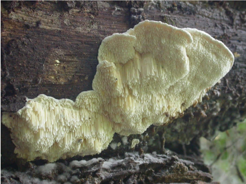
Fig. 1. Donkia africana , the holotype.

Remarks. The lack of cystidial organs and the globose spores characterize this species.